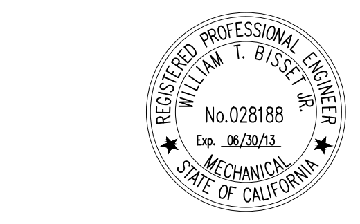
SHEET INDEX 1